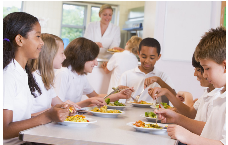
Local growers can help schools meet Ontario Ministry of Children and Youth Services nutrition guidelines.

The summit revealed creative ideas at work. For example, public health dietitians had observed that one city needed to fill a gap to meet the Ministry of Children and Youth Services